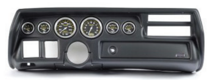
Malibu Sweep Version

Multiple gauge sizes are offered for this application. See website for pictures of all combinations.