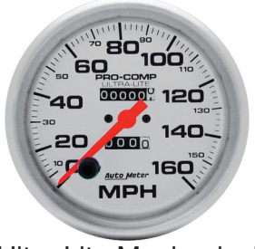
Ultra Lite Mechanical