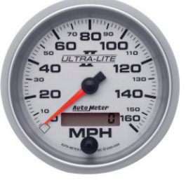
Ultra Lite II