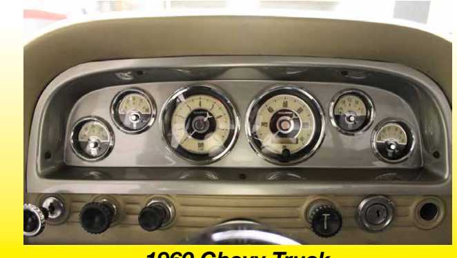
1960 Chevy Truck